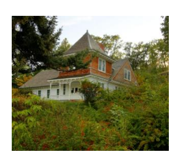
Von Bayer Museum of Fish Culture at DC Booth Historic National Fish Hatchery and Archives.

Fish Hatchery (NFH) and Archives (formerly Spearfish NFH) in Spearfish, SD. A contract has been signed with The Lodge at Deadwood, about a 10-minute drive from Spearfish. As we previously announced via e-mail, they offered a nightly rate of $129 plus taxes that includes a light continental breakfast of coffee, toast, muffins, fruit and juice and complimentary airport shuttle service to Rapid City. Locals who have attended functions there say it has always been good. That special