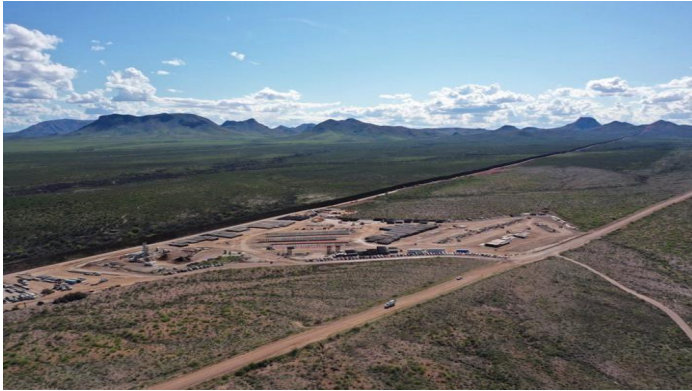
Border wall construction infrastructure is seen cutting through the landscape of southern Arizona.

Wildlife officials watched helplessly as the water levels at several ponds—the main habitat for the endangered fish at this Sonoran Desert refuge—dropped “precipitously.” In what Bill Radke, who has managed the refuge for two decades, called “life support” actions, staff was forced to shut off water to three of the ponds to minimize broader damage. As a result, biologists had to salvage endangered fish from the emptying ponds. It was “like cutting off individual fingers in an attempt to save the hand,” Radke wrote in an email to staff.