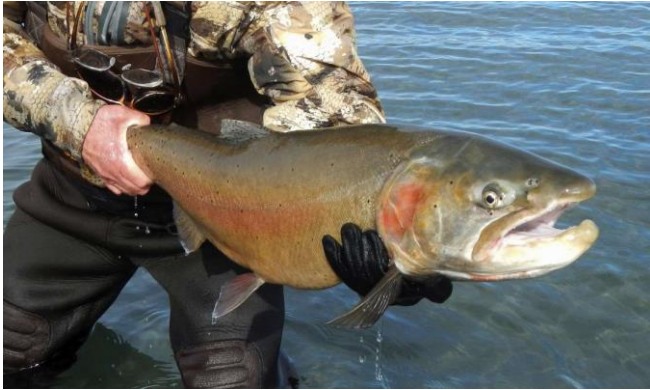
This 2019 photo shows a Lahontan cutthroat trout recently caught at Pyramid Lake

Construction of the side channel with fish-friendly screens will hopefully enable Lahontan cutthroat trout to make the same 100-mile journey from Pyramid Lake in the Great Basin desert up the Truckee River to Lake Tahoe atop the Sierra, that they did before the dam was built in 1905.