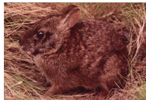
Lower Keys Rabbit (AKA "Playboy Bunny")

Endangered Playboy Bunnies? The Lower Keys Rabbit is the smallest of three subspecies of marsh rabbits. It can reach a length of 14-16 inches. These rabbits inhabit higher elevations around