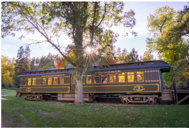
Newly repainted Fish Car #3 glistens in the autumn sun on the D.C. Booth Historic National Fish Hatchery and Archives grounds in Spearfish, SD.