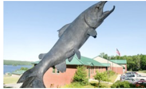
Leaping salmon sculpture at Craig Brook NFH.