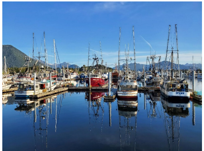
Commercial fishing boats, Sitka Alaska

A federal judge in Washington state recently issued a ruling that threatens to shut down trolling for king salmon in Southeast Alaska this summer. The ruling in a lawsuit filed three years ago by the Washington state-based Wild Fish Conservancy aims to protect a small population of orcas. The lawsuit centers on whether Alaska fishermen should be allowed to harvest king salmon, which are considered essential prey for the Southern Resident killer whales.