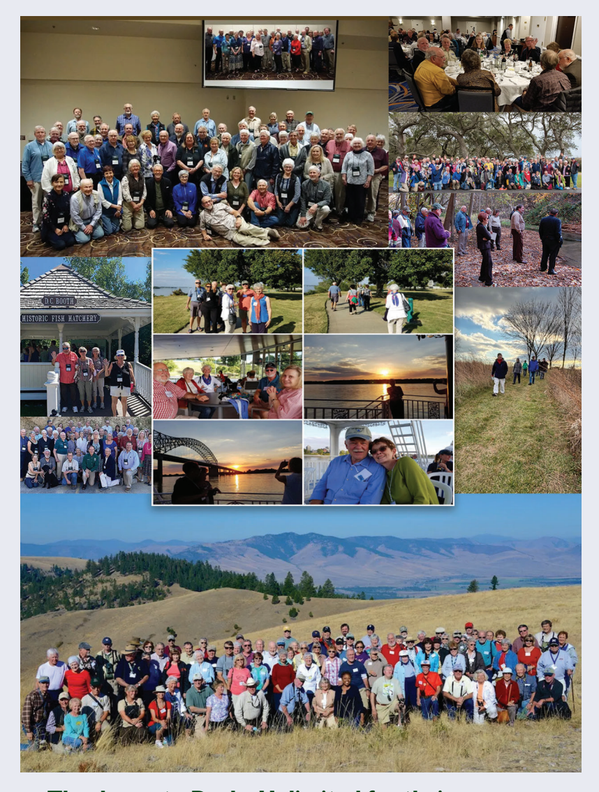
Thank you to Ducks Unlimited for their generous contribution to sponsor this Reunion!