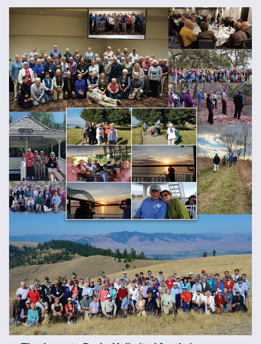
Thank you to Ducks Unlimited for their generous contribution to sponsor this Reunion!